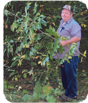
AmeriCorps Trail Maintenance