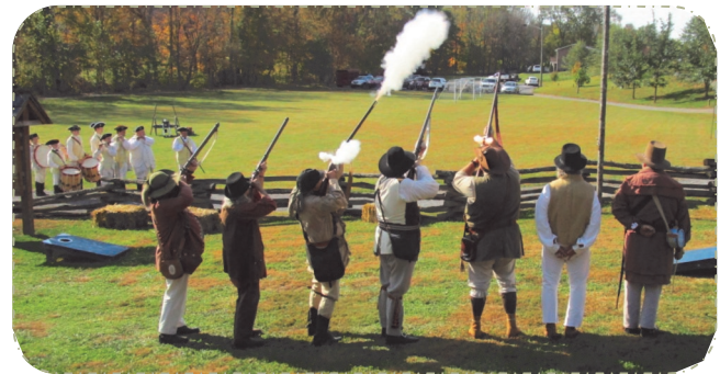
Heritage Days 2017

Did you know our state name, Tennessee originated from the "Tanasi" name of an historic Cherokee town in present-day Monroe County?