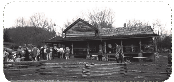
Bogart-Bowman Cabin, Est. Late 1700's 5012 Unicoi Dr, Unicoi TN 37692

The Forest Service is winding down after a big recreation push during the summer months. Keith says, "It was really successful; a lot of campground activity!" NEW bear-proof dumpsters have recently been installed. Also, a new online reservation system for the campgrounds is in the works.