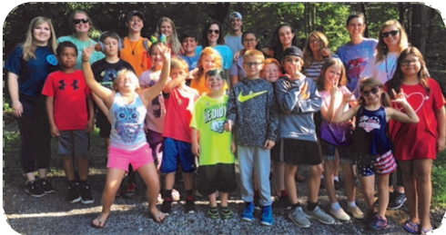
Footsteps with Foodies Hike to Pinnacle

As part of the Town of Unicoi's commitment to building a foundation for a healthier community, this project is taking steps to make healthy food options and healthy environments more accessible. The $85,000 award from the Tennessee Department of Health will fund major initiatives including construction of a community Farmers Market Pavilion next door to the Visitor's Center as well as community nutritional education and physical activity programs.