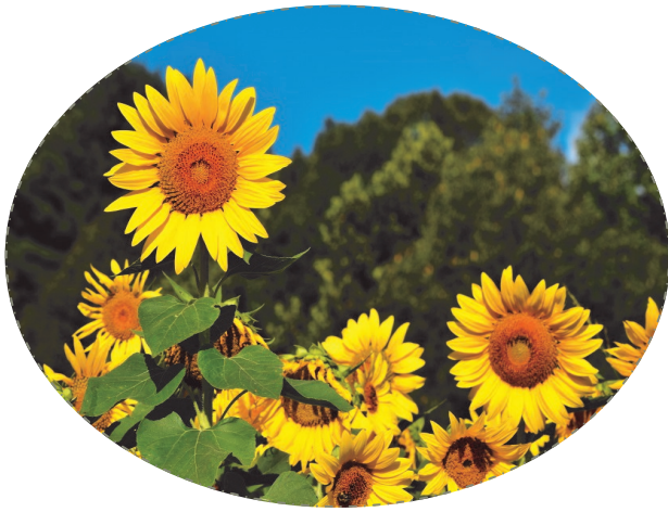
Sunflower Patch Exit 32